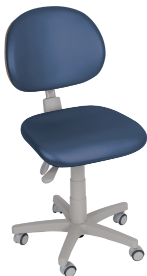
Zero Backache Stool for Doctor Comfort